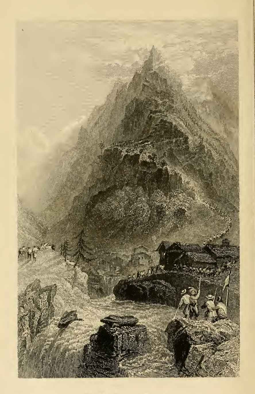
THE BALSENEE. | During the Attack